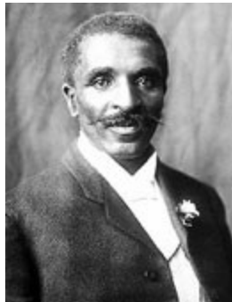
George Washington Carver 1861-1943

How well do you know your history of influential black Americans in history? This month is the time that is dedicated to remembering their legacy and impact on American culture. Here is a just a highlight of a few of those influential people that we should all celebrate this month: